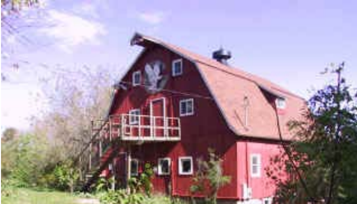
The Nature Barn

Soaring Eagles Nature Center: The CCCB also has recently entered into a unique partnership with a local, private nature center in Clinton, Iowa, Soaring Eagles Nature Center. Eagle Point Nature Society manages the grounds and buildings and the Clinton CCB conducts the EE programs, creates displays and cares for the collections. The Center includes 3 miles of trails, an amphitheater, Clinton County's last one-room schoolhouse and remodeled 1938 barn known as the Nature Barn.