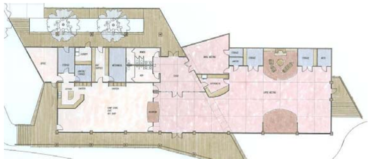
Mississippi River Eco Tourism Center Floor Plan