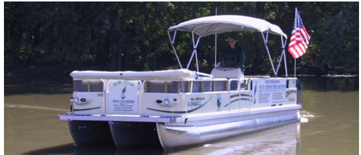
The Blue Heron Eco Cruise Pontoon

Blue Heron Eco Cruises: This is the CCCB's newest program and asset. In the past, groups that came on Mississippi River field trips at Rock Creek were limited to the backwaters in canoes, or very small groups in flat-bottom boats. The CCCB purchased a 30-passenger pontoon boat that serves as a vehicle to get groups onto the main channel as well as backwaters to get a much more com-